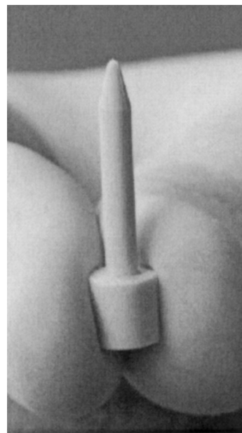
Figure 1. SIMPL (profs-products.com) silicone implant.

All milk flow disorders were treated surgically by removing dislocated tissue with a punch, dilating narrowed teat canals with a lancet, or extracting free bodies from the teat cistern with a forceps (Geishauser and